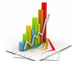
Environment & Economic Development